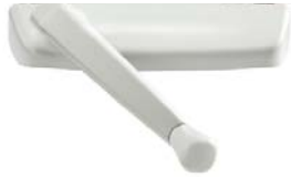
Casement Handle (standard white)