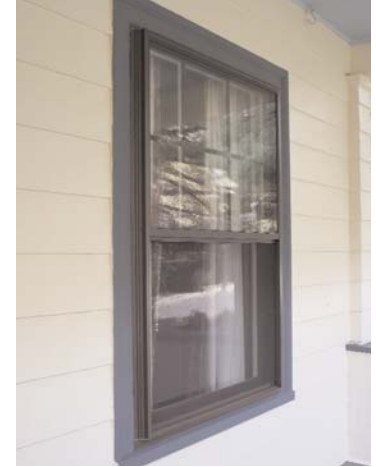
Harvey Tru-Channel storm windows are carefully engineered to ensure maximum performance.