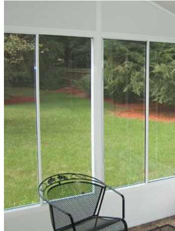
Rolling storm window